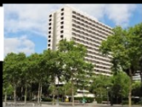
Hospital Militar Gómez Ulla